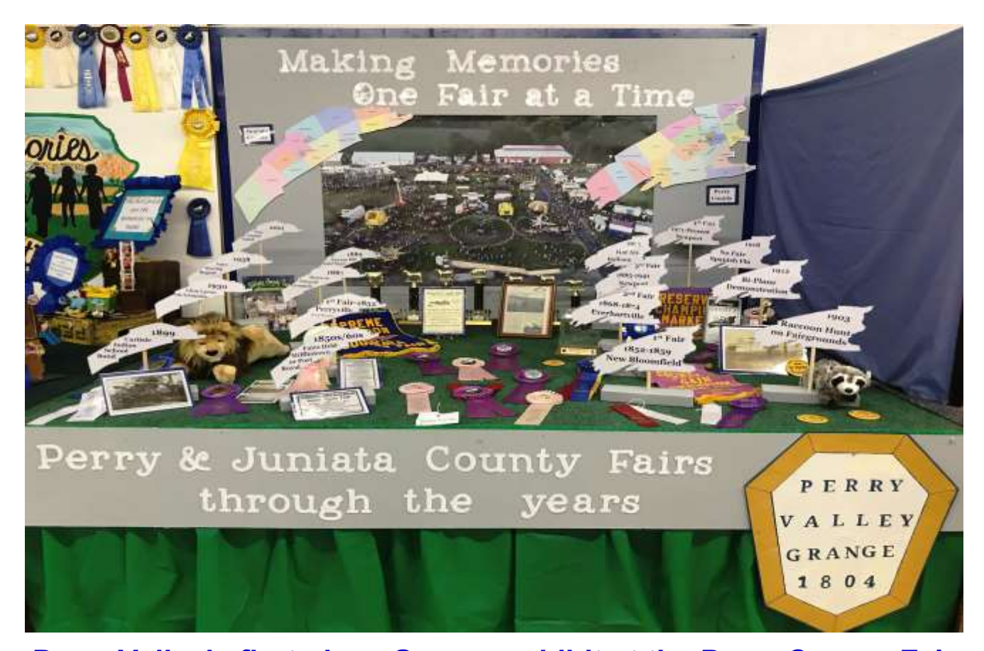
Perry Valley's first place Grange exhibit at the Perry County Fair